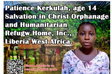
Patience's Amazing Transition https://youtu.be/55N9120t4vQ Speaker: Chat & Chew Ministry