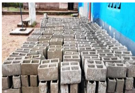
Bricks molded for construction projects.