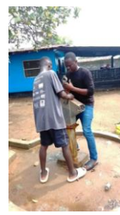
Repairing the well pump .