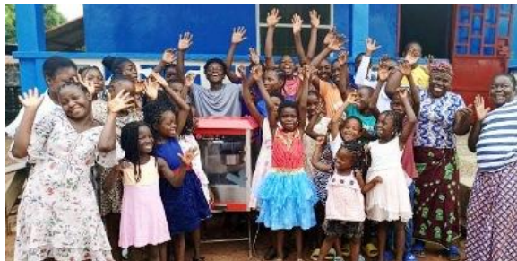
Celebration of their New Popcorn Machine