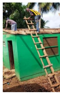
New roof for big boy's house.