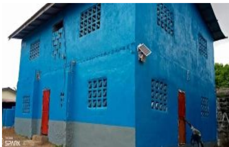
Rain damage necessitated replastering & repainting school.