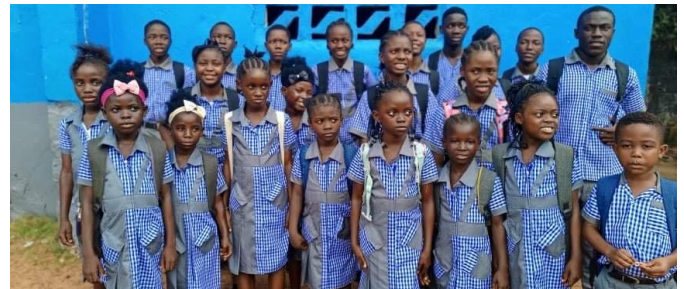
Elem/Middle School Students in New Uniforms

The monthly budget for basic needs for SIC is $1,530US , with $465US for salaries and stipends, and $1,070US for food and cooking, personal items and other necessities as itemized below: