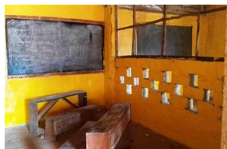
School second floor gets a face lift with electrical wiring and paint.