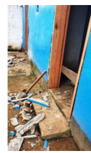
Bathroom door frames.